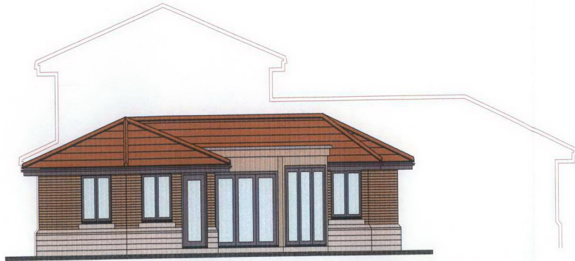
Proposed South West Elevation ( scale 1:100 )