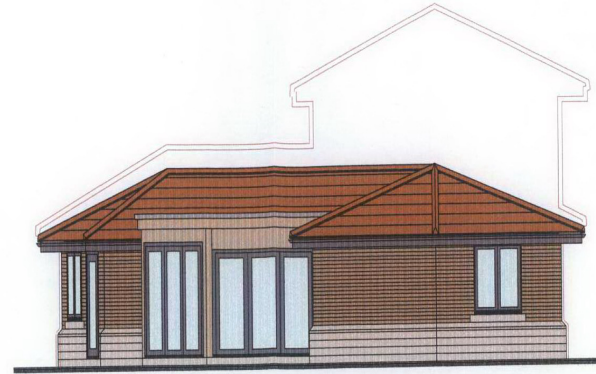
Proposed South East Elevation ( scale 1:100 )