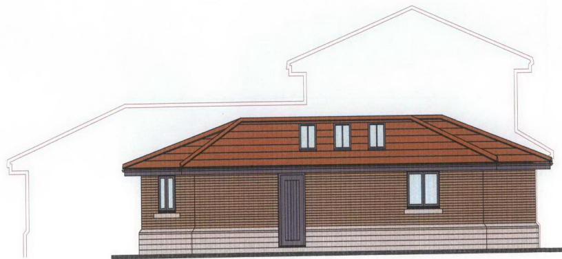
Proposed North East Elevation ( scale 1:100 )